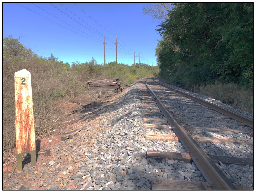
View of Black River & Western main track facing north at Milepost 10. Existing track shall be removed and replaced with 132#RE rail on steel ties., west.

1. The Schedule 2102F workscope includes the removal of approximately 2,040 track feet of existing predominantly 100#PS and 100#PRR rail on wood ties, knocking down the cribs and preparing a new subgrade and constructing approximately 2,040 track feet of new track using 132#RE rail and steel ties. The work also includes a Hayes style bi-directional derail at the south end of the siding.