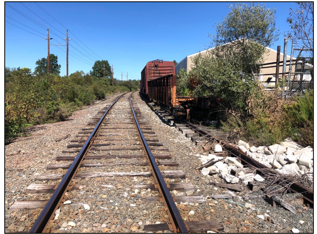
View of Black River & Western main track facing north with the existing siding on the east (right) side. Existing siding shall be removed and replaced with 100#PS rail and wood ties salvaged from Schedule F work.

1. The Schedule 2102G workscope includes the removal of the existing Copper Hill siding, knocking down the cribs and preparing a new subgrade and constructing approximately 442 track feet of new track using 100#PS rail and OTM and relay wood ties salvaged from Schedule F work.