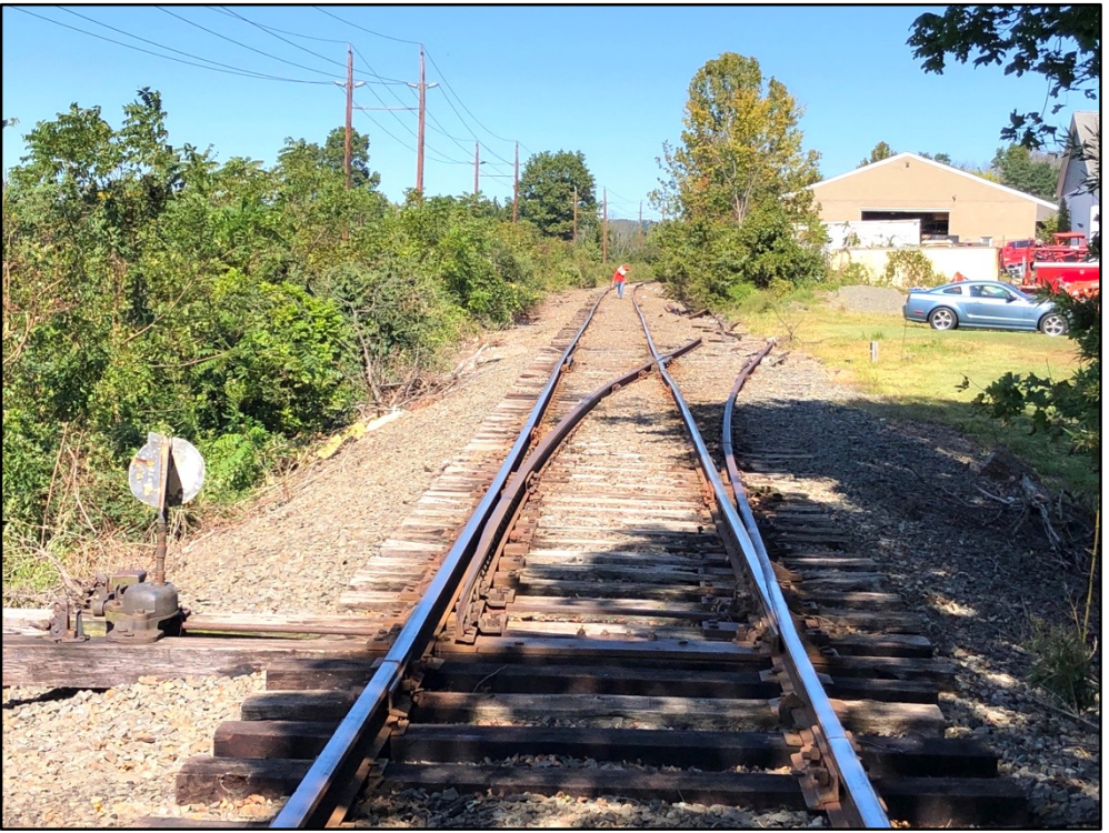
View of Black River & Western Railroad No. 8 turnout at south end of Copper Hill siding to be replaced with a No. 10 turnout at the same location.

1. The Schedule 2102E workscope includes the construction of two (2) No. 10 turnouts.