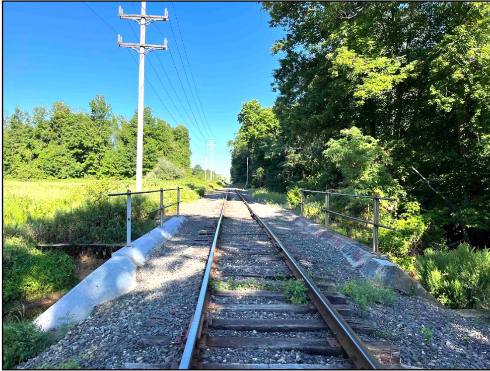
View of Delaware & Raritan River Railroad Freehold Branch facing (Timetable) North toward Englishtown from Bridge 13.02. Existing track shall be removed and replaced with 136#RE rail on steel and wood ties from the North side of Bridge to Station Road at Englishtown, a distance of approximately 2,890 Track Feet.