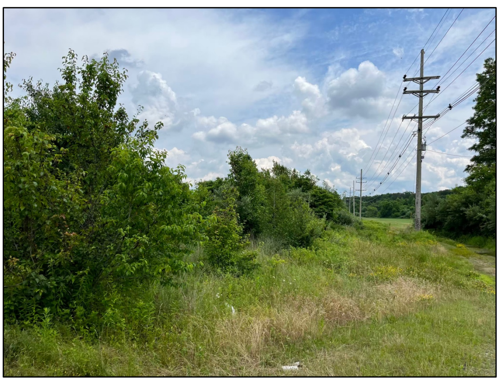
View of F&S Connection right-of-way at Oakerson Road facing east toward Farmingdale showing typical heavy vegetation growth. Track is removed a distance of approximately 100' from public roads, but is otherwise in place.

F&S Connection SCHEDULE 2204G VEGETATION CLEARING