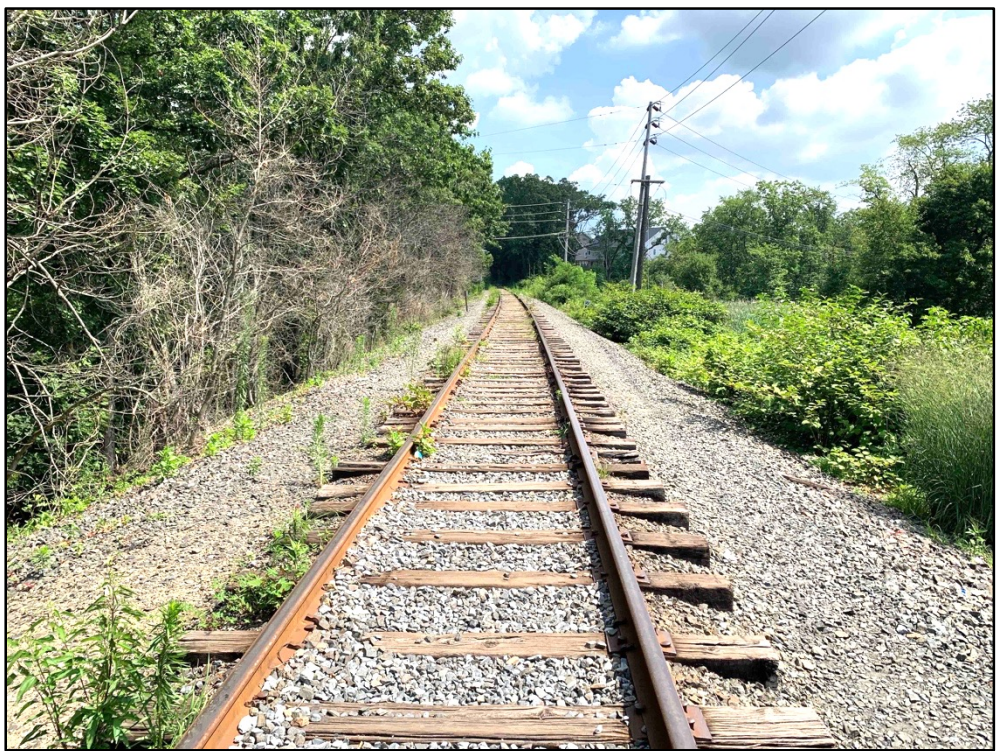
Typical tie, rail, ballast, and vegetation conditions on the Southern Branch between Farmingdale and Lakewood, NJ.

1. The Schedule 2203F workscope includes the replacement of 2,500 wood ties on the Southern Branch of the Delaware & Raritan River Railroad between Farmingdale and Lakewood, NJ. The purpose of this project is to ensure there is one (1) effective crosstie under each joint and at least one (1) effective crosstie in the middle, more or less, between each joint.